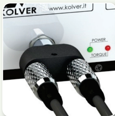
DOUBLE OUTPUT CONNECTOR FOR KBL

A double output connector is available for operators using two KBL screwdrivers in the same working area. Model DOCK02 (code 020035) is meant to be used with KBL..FR, while model DOCK02/S (code 020035/S) is to be used with KBL..FR/S (with signals) or KBL..CA (for automation). The two screwdrivers can be used at the same time.