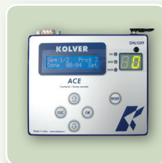
ACE SCREW COUNTER (see page 24)