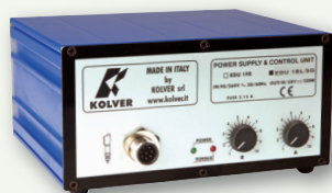
EDU1BL/SG Control unit with signals

All Kolver screwdrivers work in combination with a control unit acting as an AC to DC transformer and torque controller. The electronic control circuit cuts the power supply to the motor as soon as the pre-set torque has been reached. The EDU1BL, and EDU1BL/SG control units for KBL screwdrivers feature maintenance free state-of-the-art electronics with no wearing components. They come standard with the torque knob to adjust the torque (from 60% to 100%) of current control tools and a green LED which indicates when the control unit is on. EDU1BL/SG control unit works with KBL..FR/S or KBL..FR/CA and it additionally features signals for reached/not reached torque, pressed lever and remote start/reverse. A double output connector (Dock02 or Dock02/S for models with signals) is also available for operators using two screwdrivers at the same time. KBL..FR screwdrivers work in combination with our standard EDU1FR controllers. This option will allow existing customers to replace FAB & RAF drivers with no need to replace controllers.